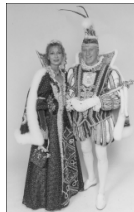
S.T. PRINZ WILLIAM III. I.L. PRINZESSIN ELIZABETH II. Regieren unter dem motto "Der Wein Muss Alt und Jung das Mädle Sein" 2002